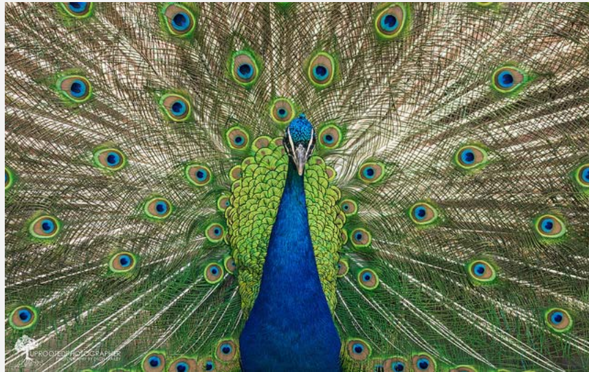
"Swagger Bird."